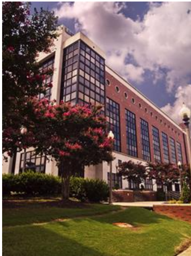
Ryals School of Public Health Building- University of Alabama at Birmingham