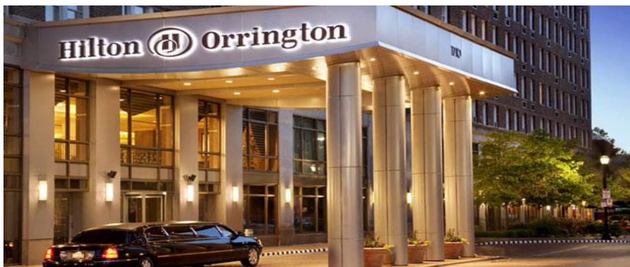
The Hilton Orrington Hotel

Each year the State and Regional Educational Research Association (SRERA) special interest group of American Educational Research Association (AERA) invites its member state and regional affiliates to each present one distinguished paper at the annual spring AERA meeting. These papers are automatically accepted for presentation and do not undergo additional review. MWERA will recognize one overall distinguished paper from its exemplary manuscripts to submit for presentation at AERA, which is being held in Chicago in spring 2015. The award recipient is expected to present the paper at AERA and will receive a $150 stipend to defray the cost of registration. See. www.mwera.org for more details.