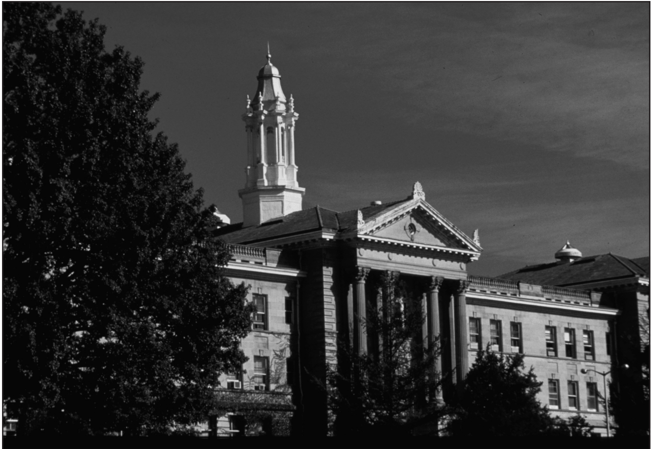
Sherman Hall, Western Illinois University

• Official Publication of the Mid-Western Educational Research Association •