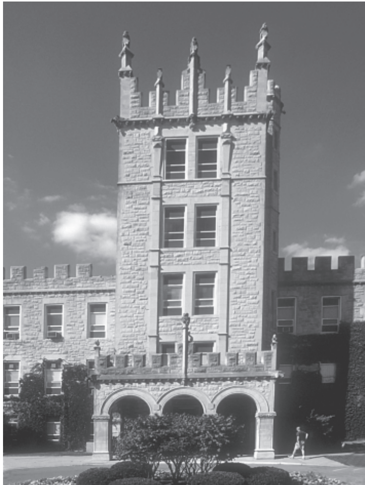
Altgeld Hall, Northern Illinois University

• Official Publication of the Mid-Western Educational Research Association •