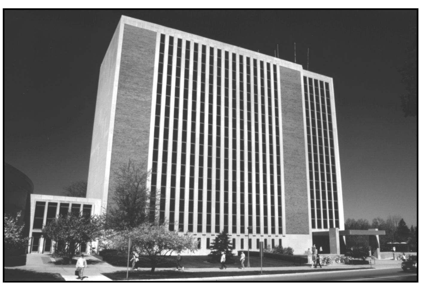
Ball State University

• Official Publication of the Mid-Western Educational Research Association •